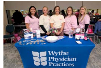
WCCH leaders, providers and staff were proud to participate in Ladies Night Out, presented by the Wythe County Breast Cancer Coalition during Breast Cancer Awareness Month.