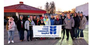
WCCH team members joined in the holiday festivities at the Wytheville Christmas Parade in downtown Wytheville.