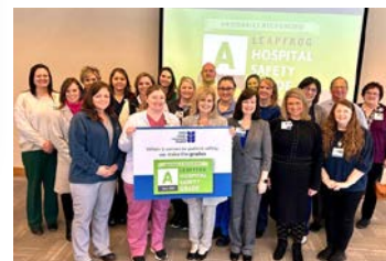
WCCH earned consecutive hospital safety grades of "A" from the Leapfrog Group for spring and fall of 2025.