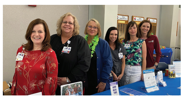
WCCH participated in a health event for the Town of Wytheville.